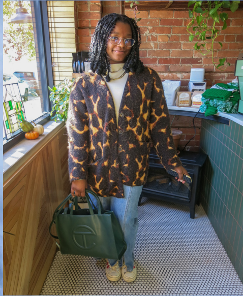
@ Milwaukee Coffee

They wear something until they're completely over it, whether it's an accessory, a make-up look or a motorcycle jacket... It would be "Very-MaryKate" to rock an item until it was done. I love this, because you develop your sense of style quickly and your choices gain a quiet strength. Repeatedly wearing something amidst a world of choices means you don't second-guess. If you know you're obsessed with something, you do it without questioning. Furthermore, you begin to understand the functionality of that item in different areas of your life. If you decide only to wear it to school or only to church or only in the rain, you only understand the item within that aspect. Fashion is more than just functionality. Fashion is fun because of its feature. This rule makes it OK that it doesn't make sense that you'd like to wear something. Expressing yourself has nothing to do with being sensical. The occasion or the weather or etc. has nothing to do with how you feel or the instant language you would like your fashion to communicate. Mary Kate made obsessing over an item a very smart choice. The tabloids who tried to police her outfits didn't matter, her confidence in her style spoke louder.