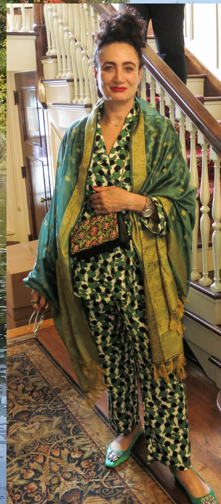
@ Boston Edison Estate Sale

Everyone wanted to be the disheveled, trendy, trust-fund celeb in an oversized pair of sunglasses, expensive designer bag, as they avoided paparazzi clutching a Starbucks Americano. Rushed, entitled yet coy, showcasing their beloved accessories but privy to the task at hand: fulfilling the legacy of their fame or holding the queendom-hood of their entertainment career.