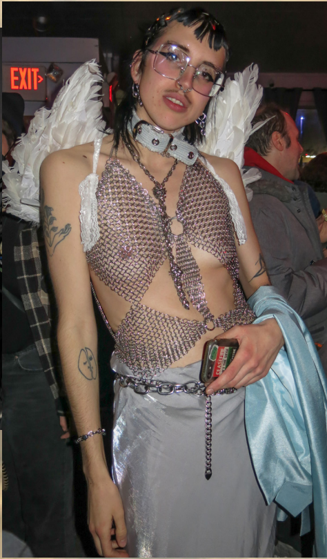
@ Siren @ UFO