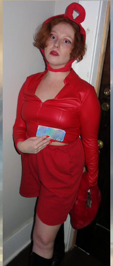
@ Halloween House Party