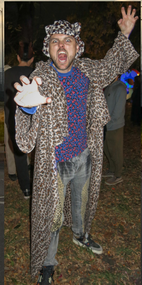
@ IT Halloween @ Tangent