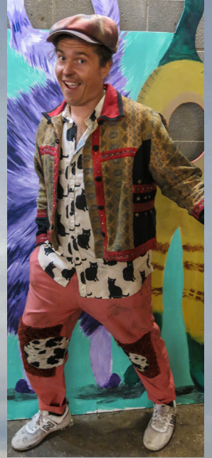
@ Warehouse Show